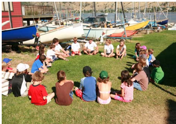
MOSS Class of 22 Opty sailors Age 7 - 12